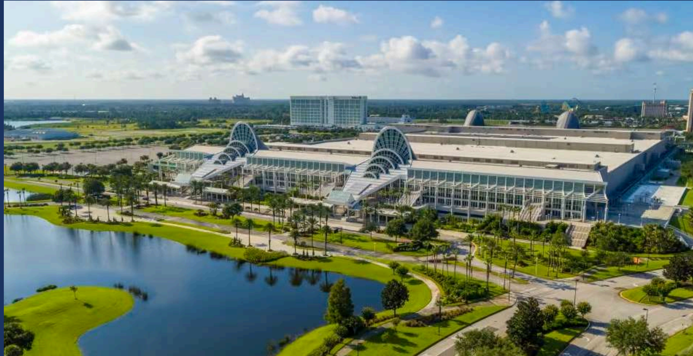
Orange County Convention Center

Click on the link for insight in sport facilities and tournament in Orlando