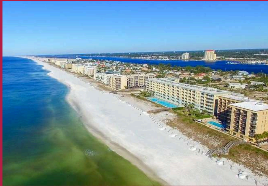
FORT WALTON BEACH